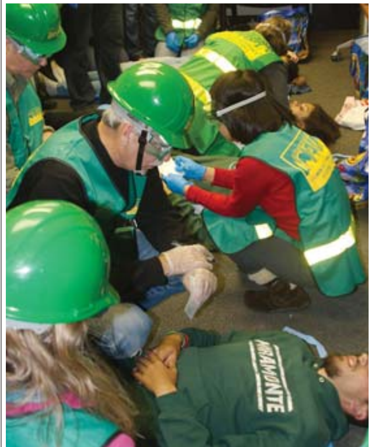
New CERT graduates practice their training.